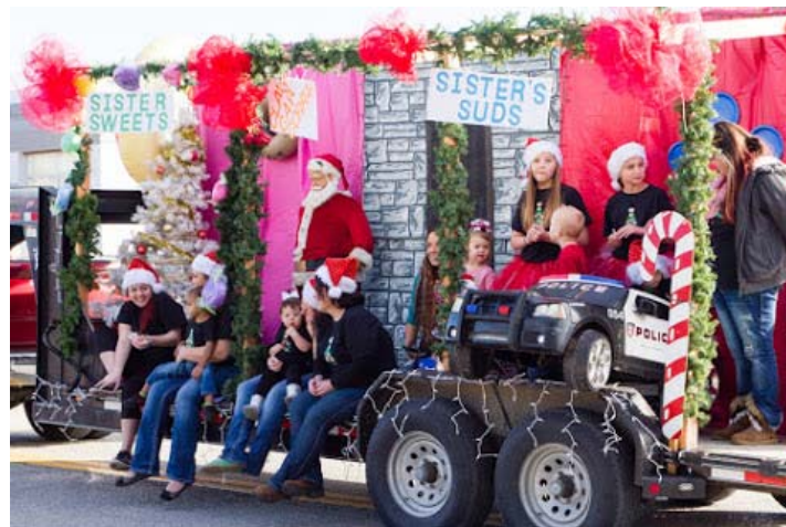
2015 PARADE FLOAT. . . Shown above is a float from last year's parade. Prizes will be awarded for best floats in this year's parade which will be at 2 p.m., Saturday, Dec. 3.

Wonder City Coffee is located at 118 E. Main. The event will be from 7:00 to 8:00 p.m. and is free and family-friendly.